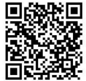
Family Ministry Portal